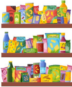
June Snack Collection