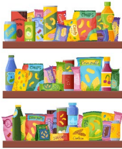
June Snack Collection