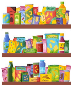
June Snack Collection